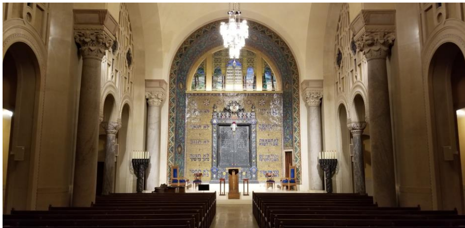
Beth-EI Sanctuary ▲